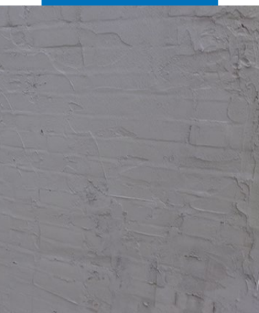
1 st base coat