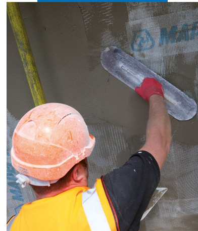
Trowel application - can be machine applied

All relevant references for the product are available upon request and from www.mapei.co.uk